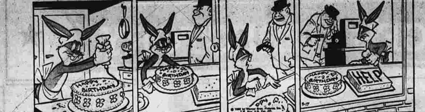
BY V. T. HAMLIN