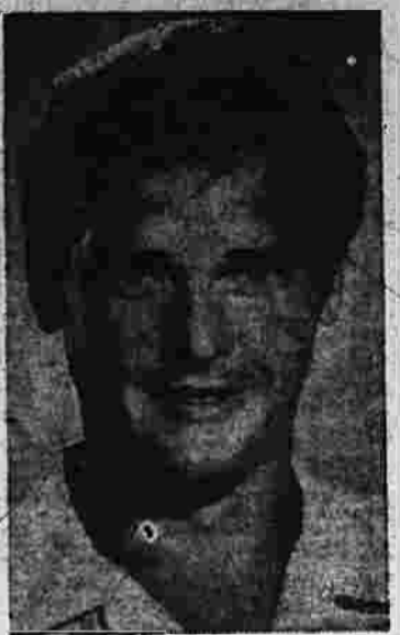
Roger Moore, above, costars as "Beau" Maverick, nephew of old "Pappy" Maverick, when the new fall season shows of the durable oater bow in.

As late as six weeks ago, Garner and Jack Warner tried to settle the dispute out of court but Gar-