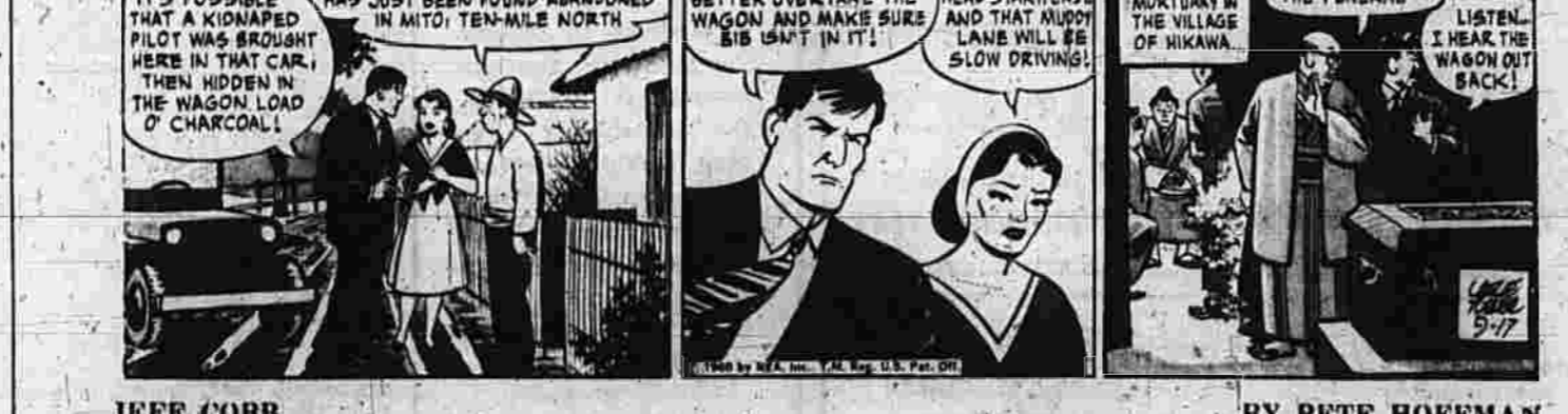
BY PETE HOFFMAN