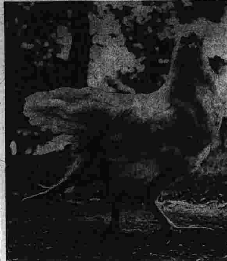
Barn Yard Queen

A similar installation in successful in Waterbury, where it serves a different purpose.