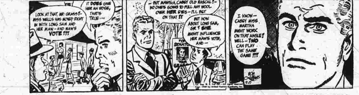
BY AL CAPP AND BOB LUBBERS