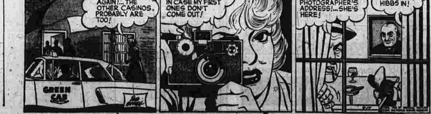
BY PETE HOFFMAN